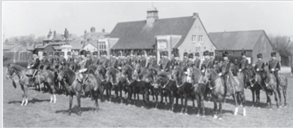
"The Imperials": The 15th/19th Hussars, 1936

Cavalry escort to the Prince of Wales, 1919 When the Prince of Wales visited Calgary in 1919, the military provided a ceremonial escort. As most of the militia units were dormant or reorganizing, the war having only ended months before, the escort was provided by the Strathconas who are seen here. The officer in the lead, however, is wearing the badges of the 15th Light Horse. GLENBOW MUSEUM, NB-16-13